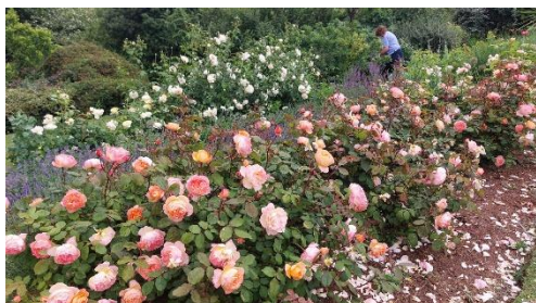
Newsletter July 2026

The 1 st June saw fifteen gardeners deadheading and weeding in Rodmoor Gardens which were a blur of colour. The roses are ‘blooming amazing’ this year! It’s a busy time and we would welcome as much support as possible at the work parties, especially prior to judging!